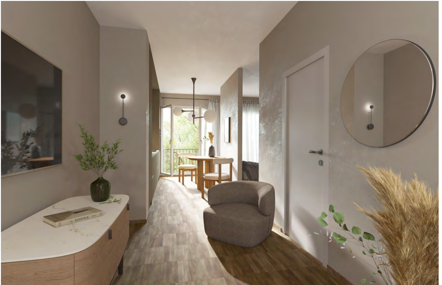
Computer Generated Images are intended for illustrative purposes only.

Over the past few years the area has seen vast expansion, the most notable is Mediaspree. A 3.7-kilometre-long development along the river bank, a collection of residential spaces and offices aimed at attracting global media, Tech & start-ups. Big names such as Amazon, Daimler, Universal Music, and WeWork have already set up offices. The Mercedes Benz Arena is also a resident, a multi purpose venue which can host up to 17,000 people. CEO of SIGNA named the area “a symbol of the favourable economic developments that Berlin has undergone in the past several years. It is currently considered one of the most sought-after office locations in Berlin.” Mediaspree is a clear boost to the economy of Friedrichshain which is only going to continue to grow.